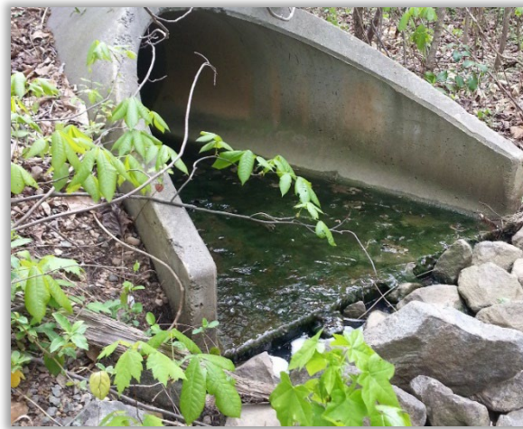
Figure 3. Example Photo showing algae growth.